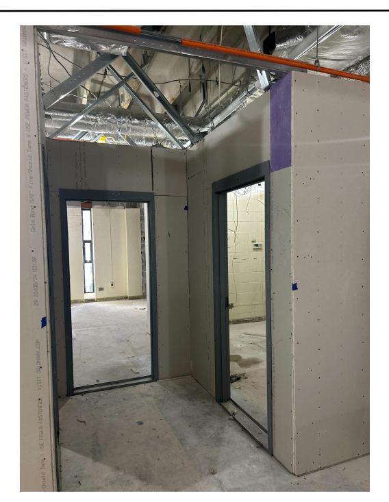
Setting door frames in classrooms on level 2.