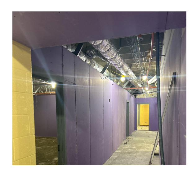
Dry wall installation in the classrooms on level 2.