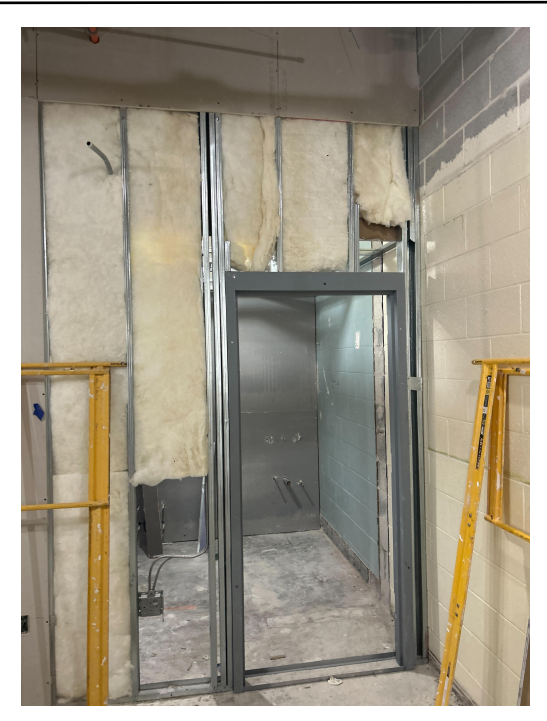
Setting door frames in the administration offices on level 2.